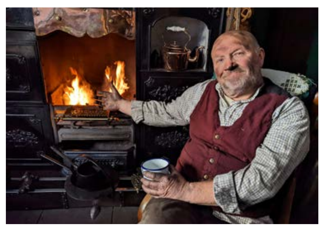
We're here to help

To find out more about group visits to Beamish Museum or to book a visit, please email bookings@beamish.org.uk, or tel. 0191 370 4026.